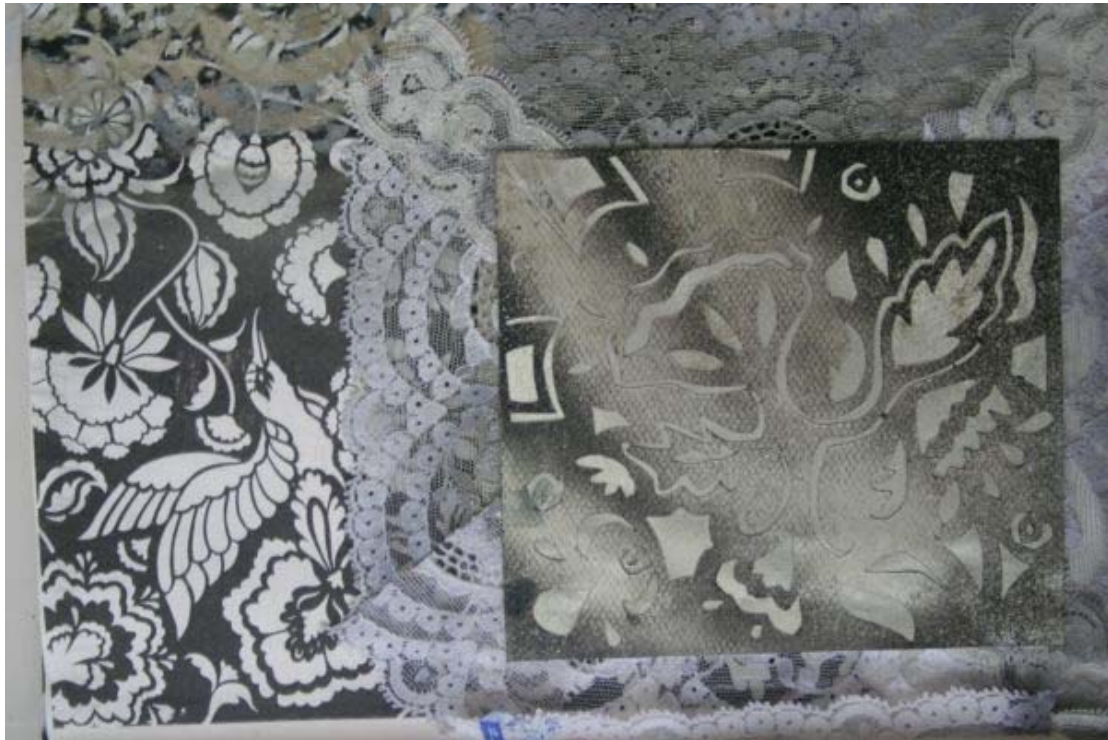
Caroline McDougall, 16: GCSE work – St.Leonards/Mayfield School

They leave flowers now Wreathes of red, green and gold All wrapped in plastic tied with notes Where skin met ground And bone met air There is no mark No fading stain to keep that spot Where smiles had died And laughter too 'In our hearts' That their claim But by the bushes thorn and branch Beside the tarmac cold and grey A shrine to petals fading grace To browning leaves And old red blood The flesh has gone Returned to dirt beneath the ground Though still screams metal, sparks and mouth Where life was left Where flowers rot.